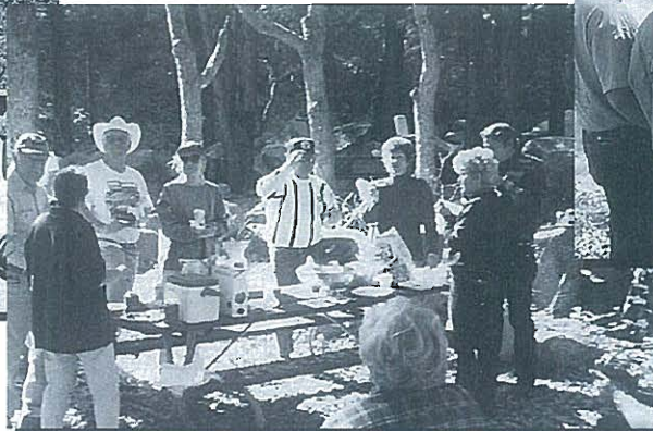
The Wild Bunch lunches at Wild Cow