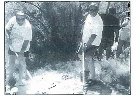
"Hey, Bob, are you sure this is where you buried the money??"