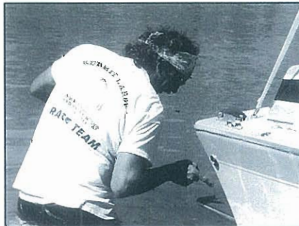
Kermit indicates he really is checking the prop.

If spending a spring day with good friends, good food and good boating sounds good to you, mark your May, 1999 calendar for Spring Roundup!