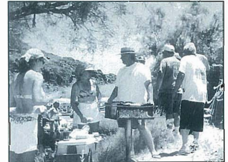
The line forms for the Parker Bros. bar-be-que.