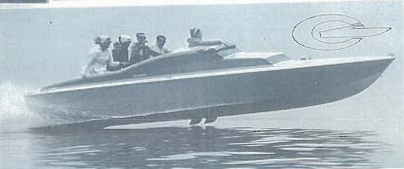
BASIC HULLS: 20' Rambler, 350 H.P., I.O. Jet-V Drive, $9,500 / 24" Cruiser, 350 H.P., $12,500 / 32" Cruiser, Twin Engine, $32,000

The sleek and exclusive hull shape of a Campbell Boat forms the basis for what is acknowledged as America's foremost hot cruiser. Add to this basis the Campbell developed boatbuilding skills, the extreme attention to perfection of all detail assembly, the sure knowledge owned by a pioneer (since 1949) in fiberglass boat building — and the reasons for Campbell prominence become apparent. That the foregoing statements are accurate is attested by the fact that Campbell Boats are No. 1 in what is without question the toughest test of all — the ability to maintain value in the RESALE MARKET. To a man about to spend the kind of money it takes to go Campbell, that RESALE-ABILITY is almost as pleasant as having the best hot cruiser around.