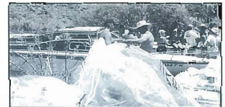
We really did pick up a lot of trash - some of it not even ours!

The basic schedule remains the same: drinks and dinner here Friday night, competition off the Nautical on Saturday (including the poker run), then the parade through Bridgewater Channel Saturday evening, followed by dinner, dancing and the awards at the Nautical Inn. Sunday concludes the competitive events with the Extended Slalom Powderpuff. You'll find an insert in this newsletter with the registration form to be mailed in. Please respond ASAP as we need a pretty accurate dinner count for the Nautical. We look forward to the usual great weekend with good friends and all your interpretations of this year's parade theme: GREAT WONDERS OF THE WORLD!