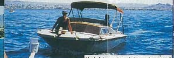
Mark & Laura Low (who took most of these pictures) are one of the poker hand stops and get to see everyone