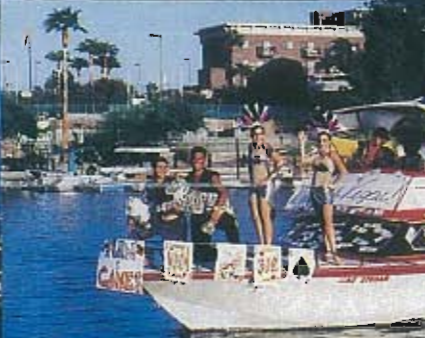
KAHN JOB wins "best costumes" with their Vegas theme and the SANGRIA crew best carries out the "Regatta Reminiscences" theme with costumes from past boat parade entries