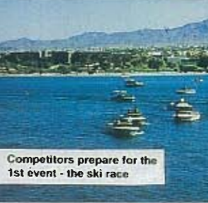
Competitors prepare for the 1st event - the ski race