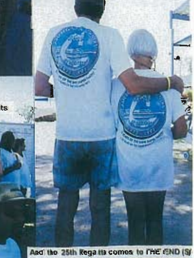
And the 25th Regatta comes to THE END (S)