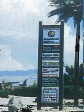
The Nautical welcomes the Regatta