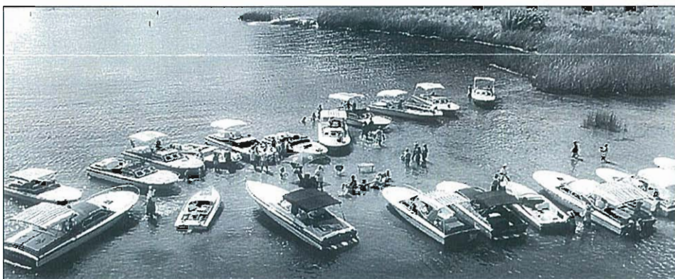
The post-Regatta party, Sunday afternoon on the sandbars.

This year's Regatta proved once again that Campbell boat owners' enthusiasm for competition and a good time has not diminished over the past 25 years! If anything, more people are competing in the ski race, slaloms and powderpuff than ever before and are having more fun doing it. Some Campbells are on their third generation of drivers! Competition results can be found in this newsletter's insert.