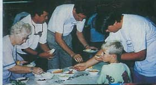
Poker hands are traded-