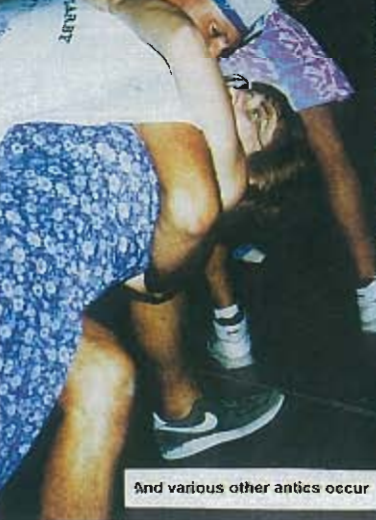
And various other antics occur