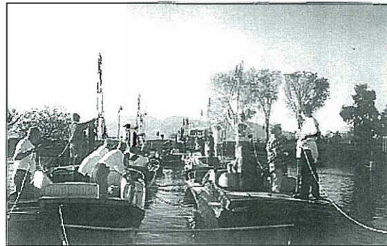
After landing all 10 boats, the lighted "reins" are adjusted to loop evenly from boat to boat.

Lake Havasu's Boat Parade of Lights is scheduled for Saturday, December 6, through Bridgewater channel and Campbell Boats has entered its now traditional Rudolph and 8 reindeer pulling Santa in his sleigh. Contrary to the "incredible precision precision driving" so much praised by last year's announcer, only Rudolph and the first two reindeer are actually under power. The other six reindeer and their crews are free to relax and enjoy drinks and snacks and the cheers of the crowds that line the channel. It's really quite a thrill to hear that huge roar coming out of the darkness and we are especially honored this year by being asked to be the Grand Finale. It should be a lot of fun and we hope you will volunteer to be part of our entry. Call Bob or Karan at (520) 855-2133 for more information.