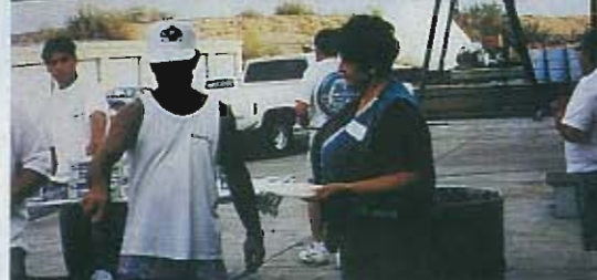
Friday night - burgers, beer and a band at the factory