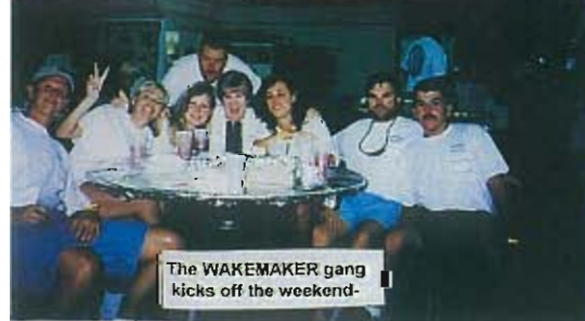
The WAKEMAKER gang kicks off the weekend-