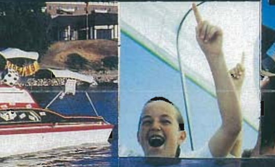
Sunday's Powderpuff & Giant Slalom is a chance for everyone to whoop it up