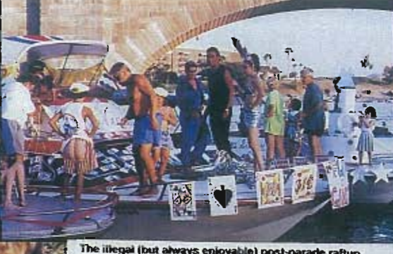
The illegal (but always enjoyable) post-parade raftup