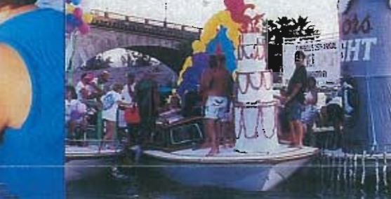
"Best Spirit" goes to WAKEMAKER with their 25th Regatta "Silver Bullet" entry. They also got "best bribe" - no coincidence there