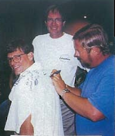
A "best wishes" tee shirt is signed-