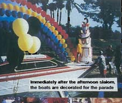
Immediately after the afternoon slalom, the boats are decorated for the parade