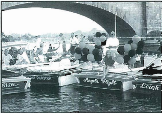
Part of the traditional after-parade raft-up at last year's Regatta.