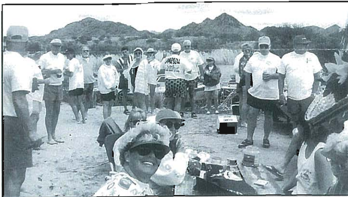
When the food comes out, the crowd gathers...