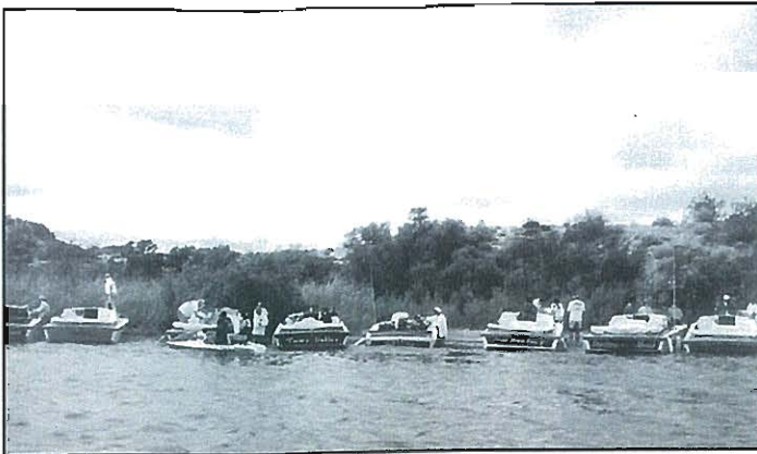
Getting situated on Three Dunes Beach.