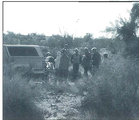
Lunch break up Standard Wash.