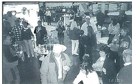
Jan. 21 – The 3rd annual Klaus' Klambake draws a crowd of sea food fans who get reacquainted around the 5 gallon jug of Bloody Marys.