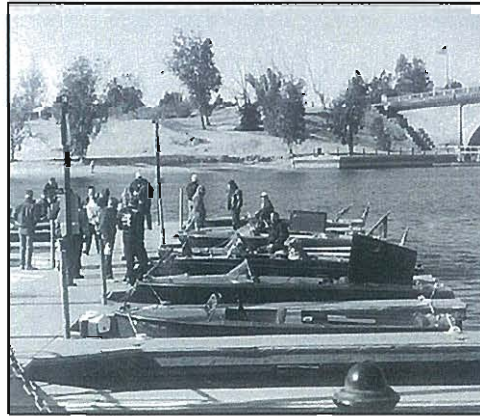
The much-admired "old woodies" at the Classic Antique Boat Show.

True, you can't "crawl a mall" in Havasu, but there are plenty of ways to spend an enjoyable day here. Plan to join us next fall for the four-wheel drive excursion.