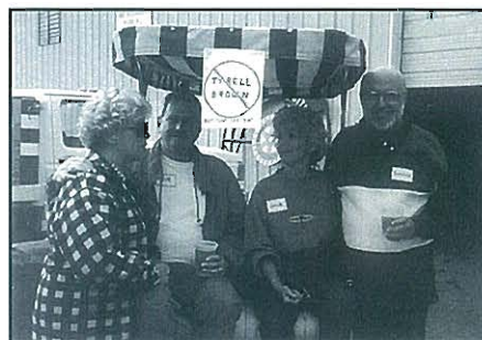
Back at the factory, we spend an entire day demolishing 40 pounds of shrimp; a case each of mussels, oysters and clams; 80 swordfish steaks and, of course, those 60 live lobsters. Some participants in the past have worked up an appetite between courses by off-roading in the Campbell golf cart—an activity which is here discouraged.