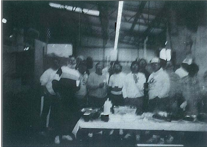
No, the building isn't on fire, it's just the Klambake macho men and those disgusting Colley cigars!