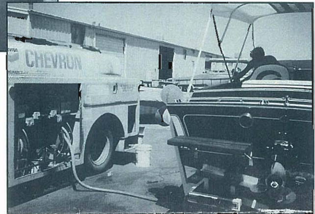
Bill Poppe fills the Brittinger's new boat with gas from our new (well, to us anyway) tank truck. We now offer on-site pumping of both unleaded premium and aviation fuel.

CAMPBELL BOAT SERVICE CO., INC. 850 LONDON BRIDGE ROAD LAKE HAVASU CITY, ARIZONA 86403