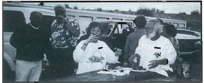
There's just nothing like a good cigar after a big meal...