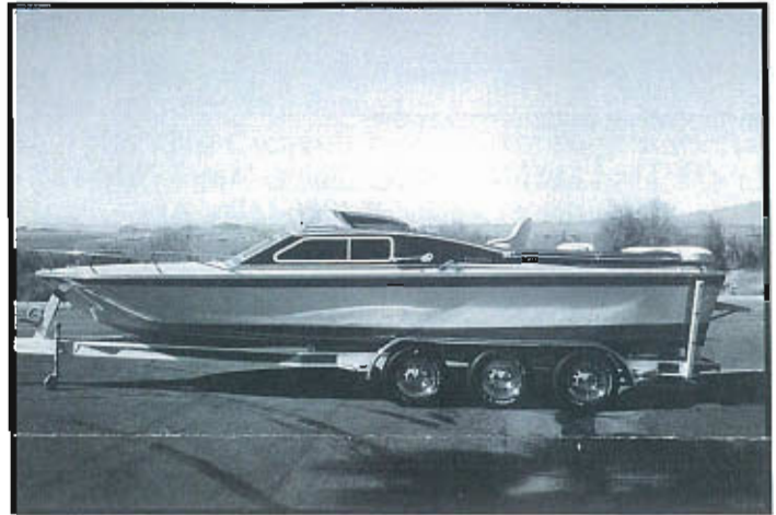
1992 Demo - 24' Campbell