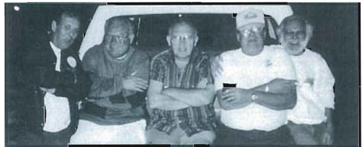
"We don't care WHAT our wives say, we're not leaving while we're still having fun!"

The group starts to split up on Sunday afternoon, with dedicated workers heading home while friends beg them to stay another day. Some leave early Monday morning, while others linger until that afternoon. (Editor's Note: probably finishing up anything left by those "dedicated workers...")