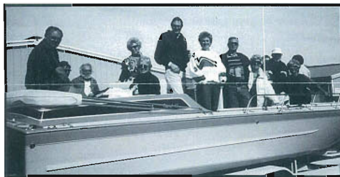
The hungry (but not thirsty) crew from the GREEN LIMO returns to the factory.

So gather your crew, fill the picnic basket and the ice chest and join us in Havasu on April 30th!