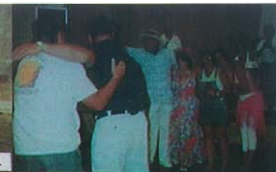
Saturday night's awards banquet.