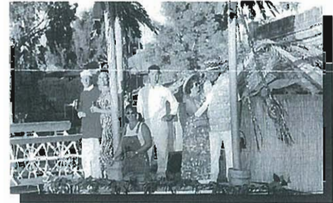
Where's the boat?? The Riggers' BORN READY becomes Gilligan's Island.