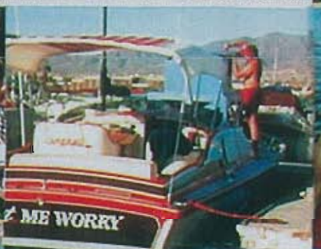
How to transform a Campbell into a TV Show in less than 2 hours ...