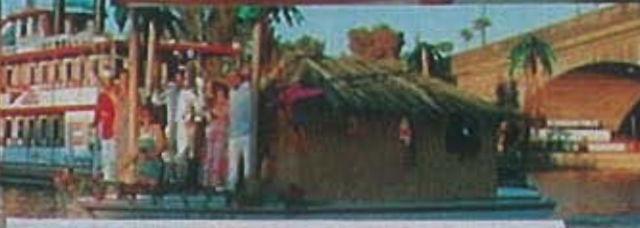
Best Theme - The Riggins' 28' Campbell transformed into "Gilligan's Island".