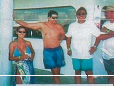
While the rest of us relax and make plans for next year.