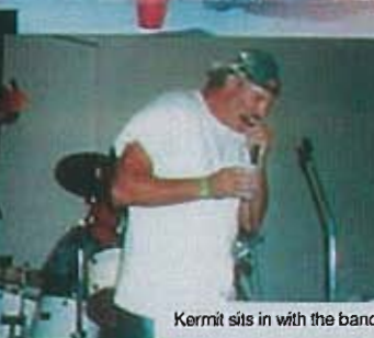
Kermit sits in with the band.