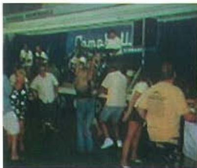
Regatta kick off at the plant with the "FAMOUS UNKNOWNNS"