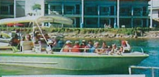
A fully loaded GREEN LIMOUSINE takes a run on the slalom course.