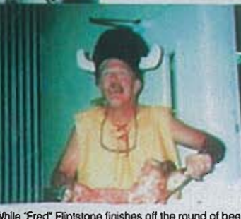
While "Fred" Flintstone finishes off the round of beef.