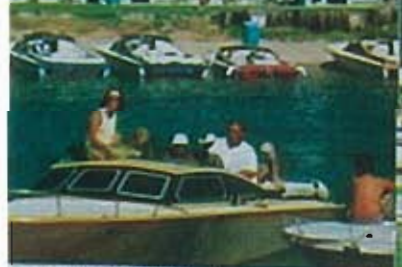
at the beach for the first Regatta event, the ski race.